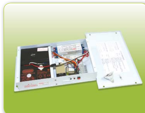
"CRYSTALITE" Cat. CC-12-50-K2+T

12V 50W Emergency Tungsten Halogen Lamp Power Pack, with timer relay and metal housing for 2 hours duration